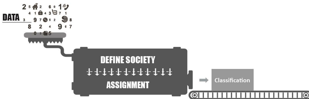
Figure 1 The traditional approach to geodemographic segmentation

The most significant features of this traditional approach, both as described in the academic literature and as applied in commercial organisations are that;