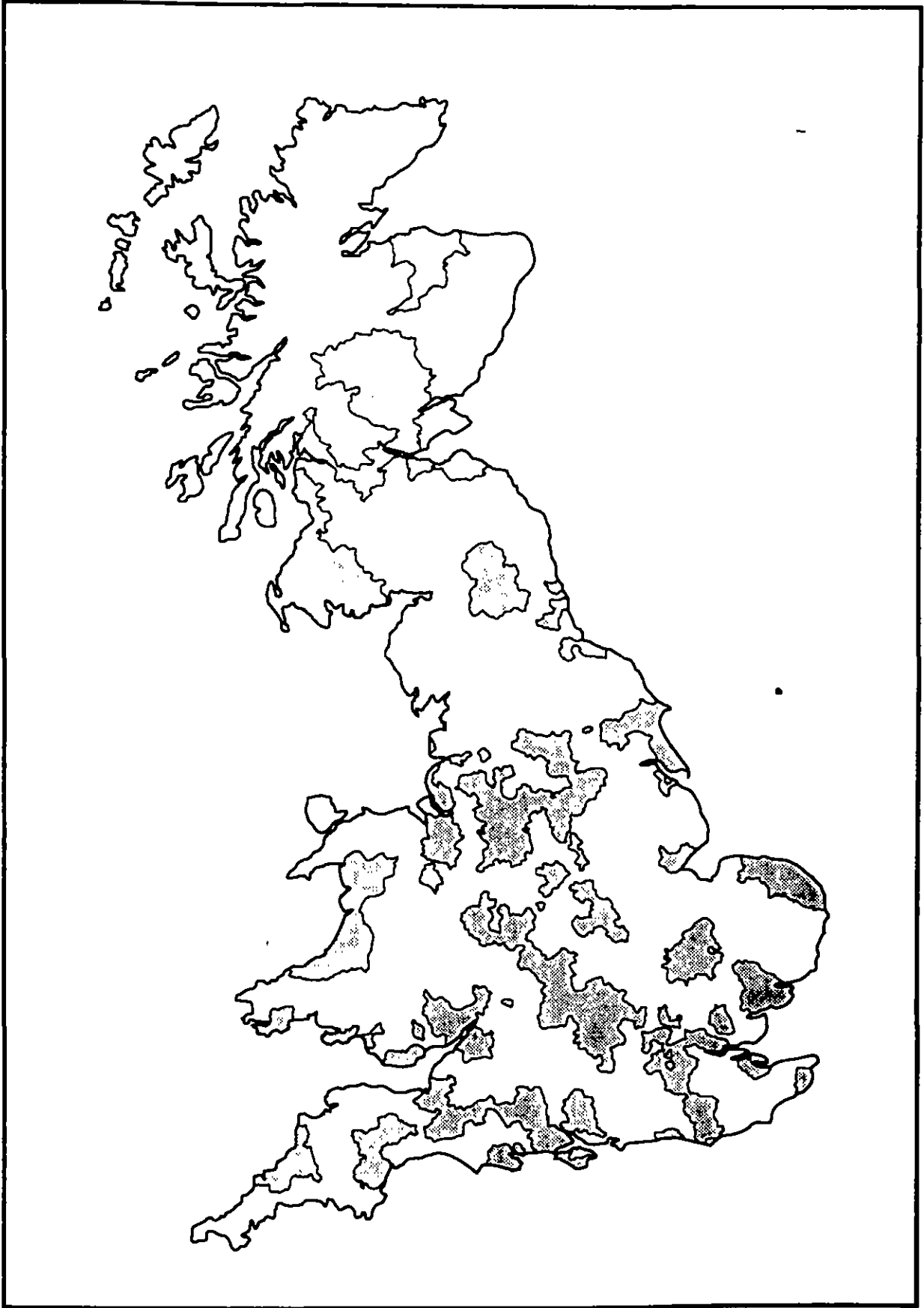
Figure 2. Shaded areas represent the local authority districts used in the N.F.S. sampling frame 1984-89